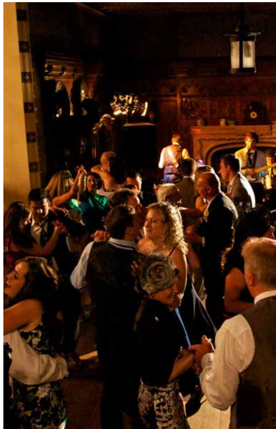
Carlton Towers, Yorkshire