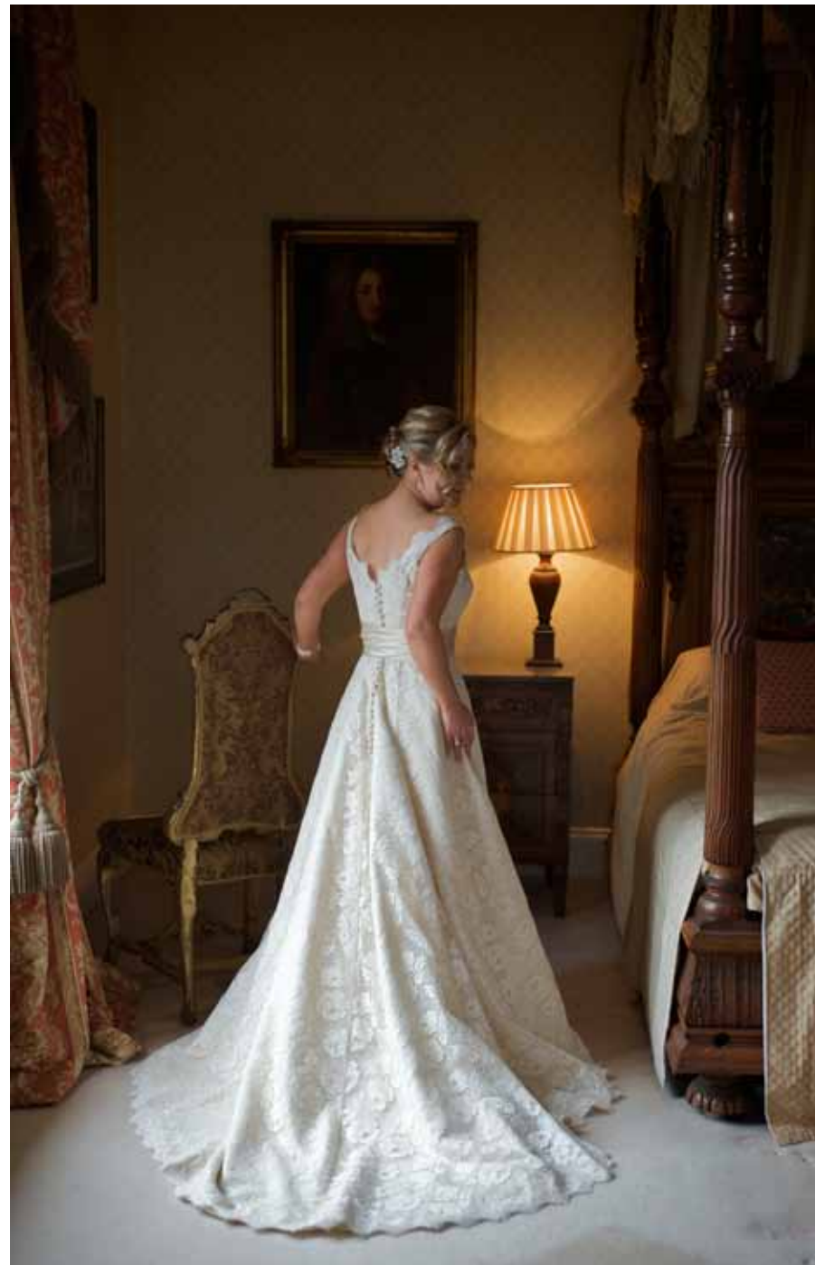
Carlton Towers, Yorkshire

Enjoy exclusive use of the venue for the duration of your stay ensuring only your nearest and dearest share your special day with the both of you. Explore the house as if it was your own, relaxing in the lavishly adorned Bow Drawing Room and the enchanting bedrooms or strolling through the extensive private grounds. Carlton Towers is only available for exclusive hire at £3850 (midweek hire fee starts from £1000).