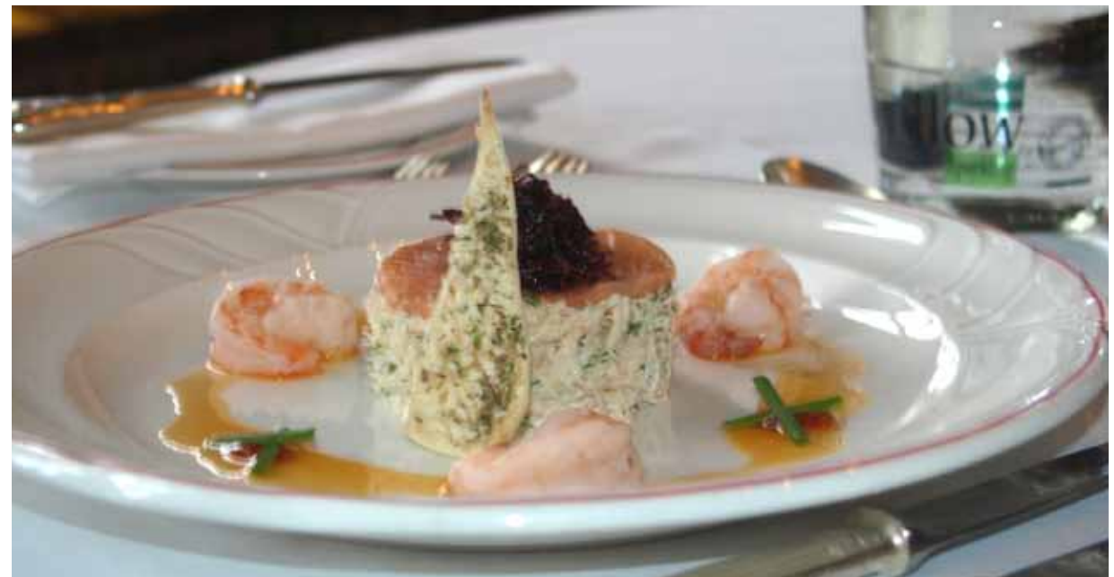
Carlton Towers, Yorkshire