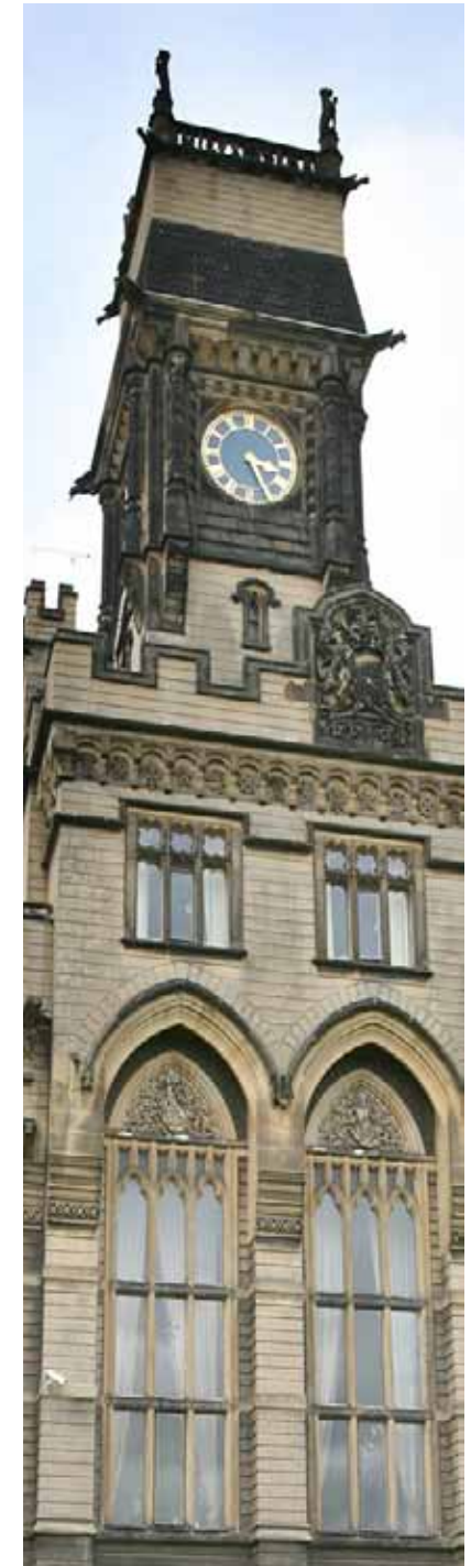
Carlton Towers, Yorkshire